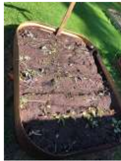
Sweet potato runner & tubers