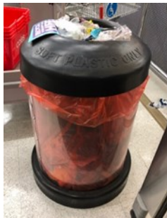
Coles plastic recycling bin

As we endeavour to become a litter free, waste-wise school, we now ask students in every year level to take home all of their plastic waste. This includes all plastic containers, foil/plastic wrappers and cling wrap. We recommend all families collect these soft plastics and take them to soft plastic recycling bins at Coles or Woolworths, such as those pictured.