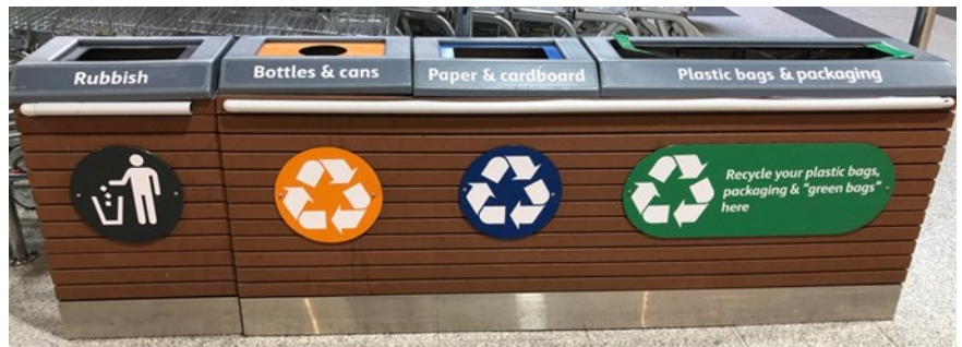
Recycling bin at Woolworths labelled "Plastic bags & packaging"

Even used squeeze yoghurt containers with caps on, can be recycled at Coles and Woolworths collection points. It has been wonderful to see that the vast majority of students bring their food wrapper free or in individual re-usable plastic containers. Mrs Millar has endorsed this change in our school. We shall continue to recycle cardboard and paper at school through SUEZ and collect food scraps to recycle in our worm farms.